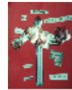
HIV Hideaway/ Angry Activist