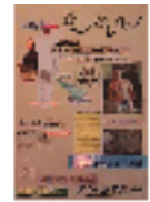
A Bad Taste in My Mouth